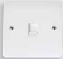
CMA115 / CMA131