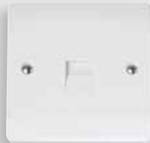
CMA119 / CMA124